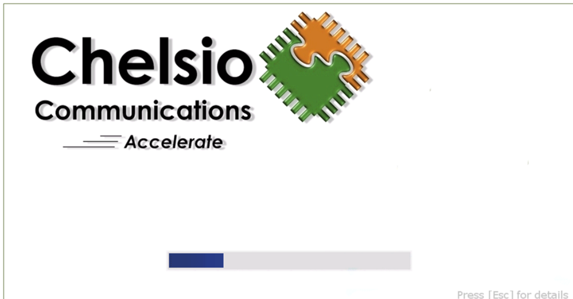
Unified Storage Server boot screen

The system will then show a Unified Storage Server boot screen with a progress bar.